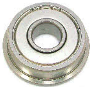
(not actual bearing)